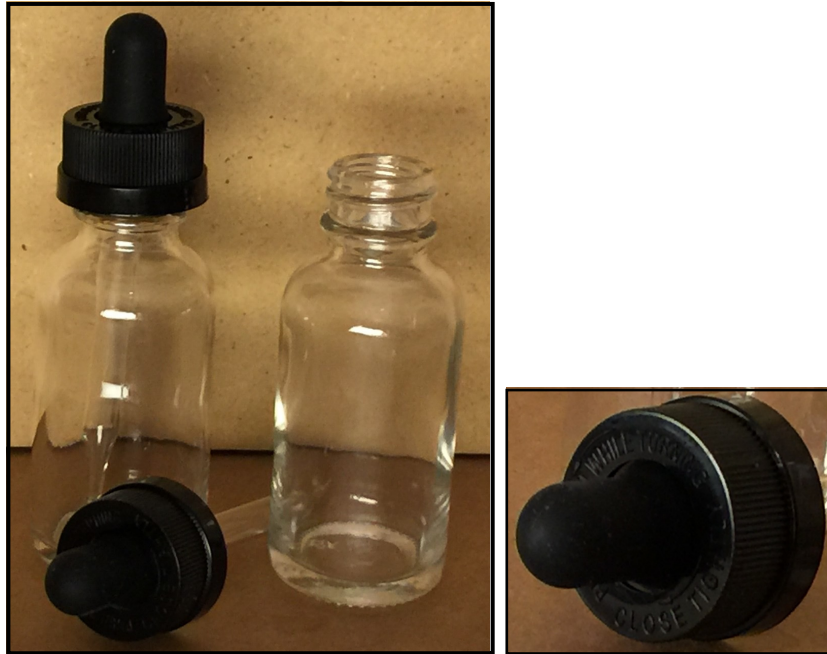
PHOTO: CR Dropper Bottle